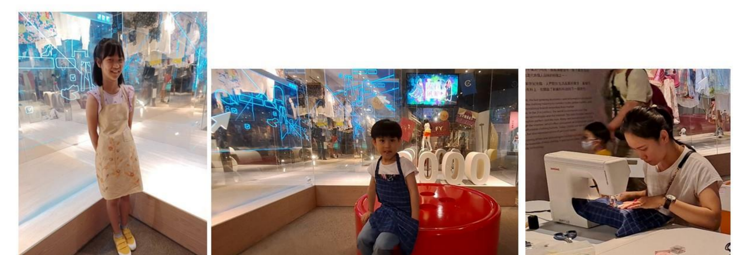
Children Day Activity in 2024