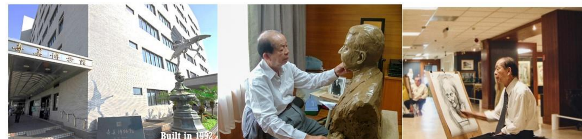
The Story of Chimei Museum