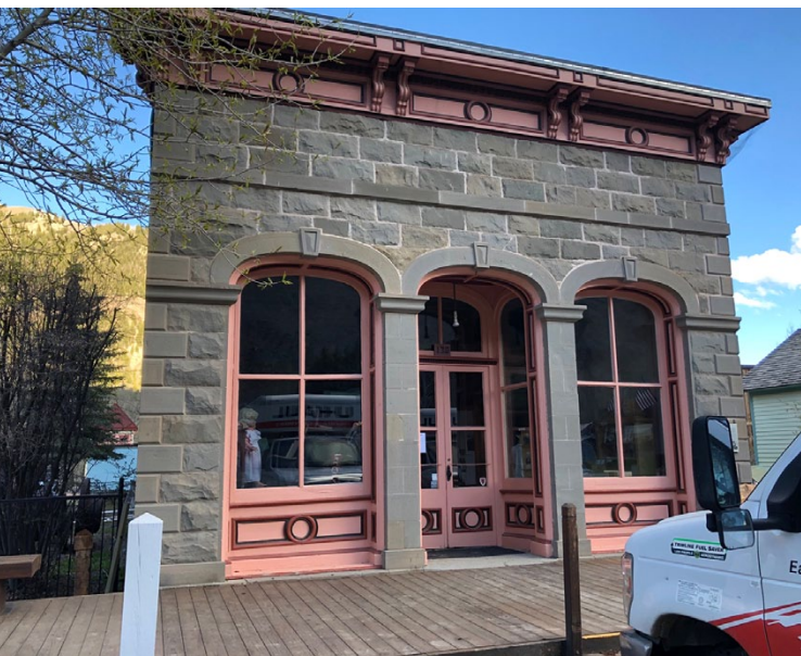
The Hinsdale County Museum was at risk for a major flood event in Colorado.