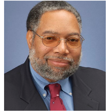
Lonnie G. Bunch III