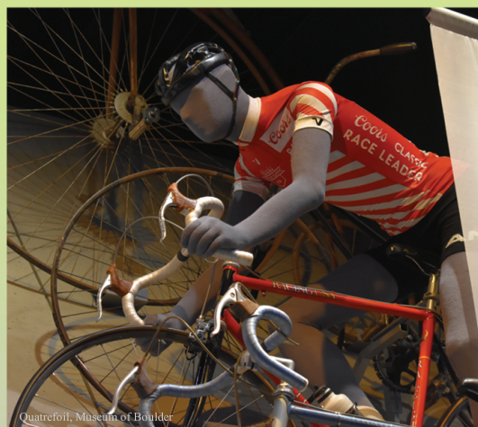
Quatrefoil, Museum of Boulder

Dorfman Conservation Forms created exclusively with Ethafoam® brand inert polyethylene foam.