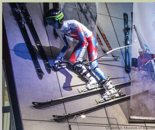
Quatrefoil, Museum of Boulder