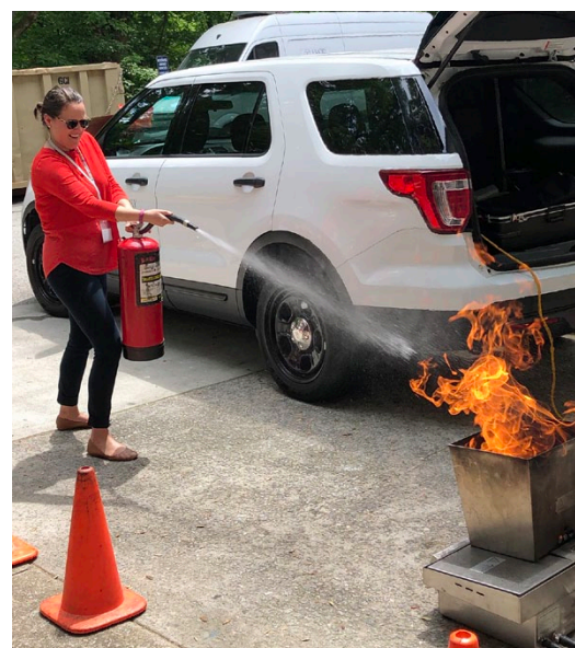
Staff members from the Carlos Museum at Emory University take part in a fire extinguisher training for MayDay.

Throughout the month of April, resources and suggested activities were shared on the Connecting to Collections Care social media pages, culminating in a Facebook Live event on May 1st that showcased the response kits held at the Library of Congress, the Smithsonian Institution Archives, and the Smithsonian National Museum of Natural History.