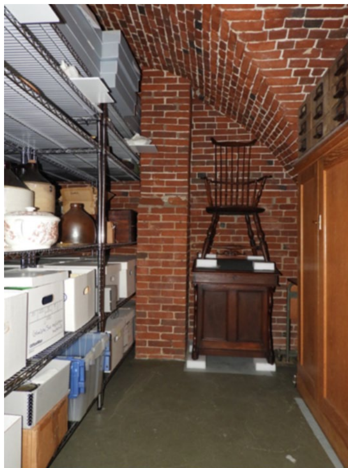
Before the RE-ORG project (left) and after (right).

synergy with the map wrapping project.... You think it should be done one way and then useful comments and input improved the process, streamlined it, and allowed us to cross the finish line!"