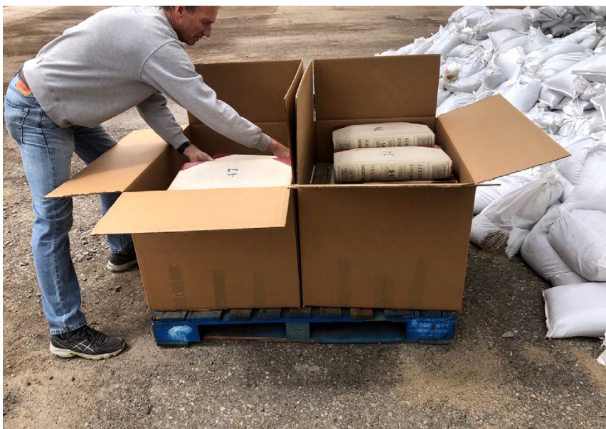
Packing out the collections at the Hinsdale County Museum.